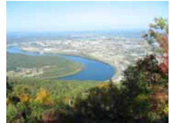
Moccasin Bend from atop Lookout Mountain

To qualify for Circle membership, a donor must give at least $600 annually to the Fund.