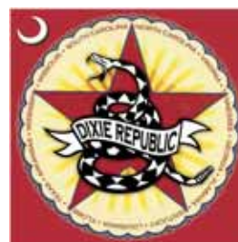
Design 3-Rattlesnake on heavyweight white cardstock

The Kershaw Foundation , a 501c3, solicits your tax-exempt donations in any amount to help fund League and other cultural and educational projects. For a limited time, donate at least $50.00 and receive as a gift I'll Take My Stand , the classic defence of Southern agrarianism. Hard-bound, library-quality book. Only 250 of this 75th Anniversary limited edition were produced. Numbered.