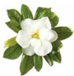
Design 1-Magnolia on heavyweight cream cardstock