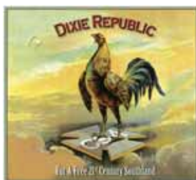
Design 2-Rooster on heavyweight white cardstock